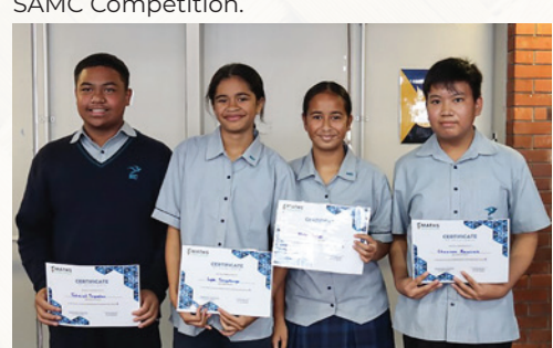
Mängere College students at the first competition at Ōtāhuhu College.

South Auckland Mathmatics Challenge has held three events so far in South Auckland this year. The first competition was at Ōtāhuhu College, the second event was at De La Salle College and the third challenge was the beginning of the Junior Schools competition at De La Salle College. Congratulations to all the winners and to all the schools who participated in this fun Mathematics competition!