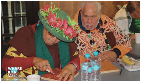
360 Tautua Trust holding a carving workshop for our elderly aiga for Samoan Language Week at Whare Koa Māngere Community House, Robertson Rd.