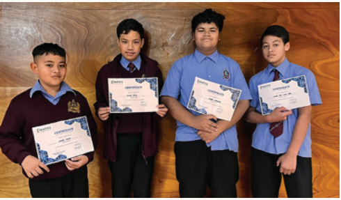
De La Salle College students at the Junior SAMC Competition.