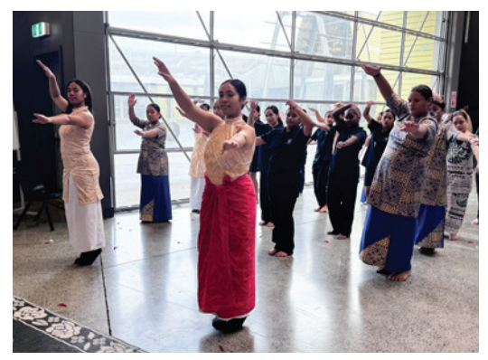
Bader Intermediate students at the Siva Workshop with the Tuiga Dance Academy for Samoan Language Week at the Mangere Arts