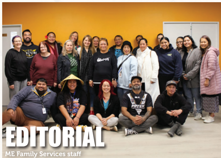
ME Family Services staff

September 28, 9am – 1pm at Ambury Farm. Friends of the Farm are holding their first Spring Seed & Seedling Swap! Bring along & swap: Seeds, Seedlings, Old pots, Plant your own seedlings, Learn to make seedling pots & food waste bags.