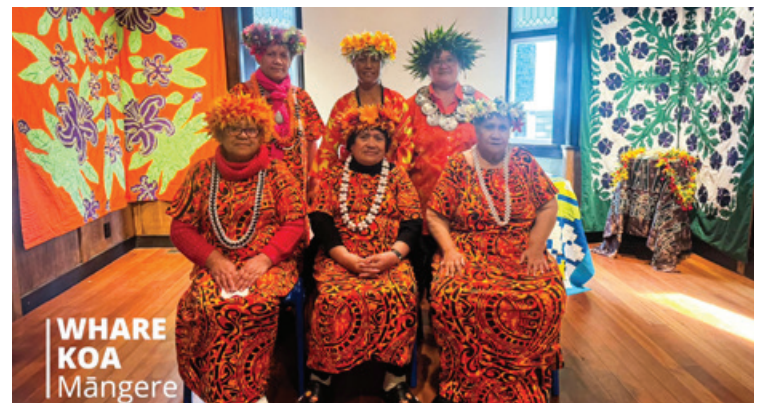
Cook Islands Language Week celebrations at Whāre Koa Māngere.