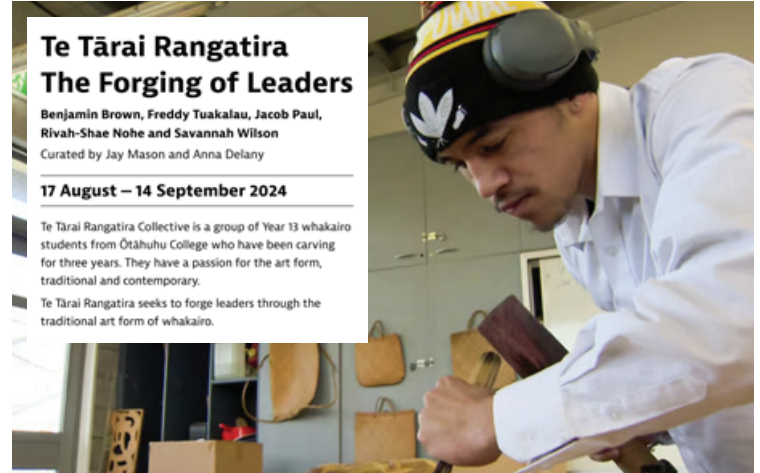
Ōtāhuhu College students are exhibiting their carvings at the Māngere Arts Centre for Te Tārai Rangatira exhibition and workshops.