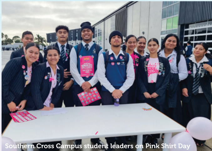
Southern Cross Campus student leaders on Pink Shirt Day

"Ina te mahi he Rangatira" - "By deeds, a chief is known." Living our school motto has been our focus as seniors to lead by example through service. We are special at Southern Cross Campus because we are a school from year 1-13. Together our ambassadors in our Junior School with