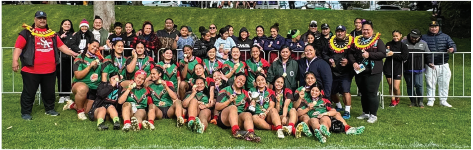
Congratulations to the Māngere East Hawks U18 Queens on winning the ARL U18 Girls Grand Final, 60 – 0 against the Jaguars.

Email 275times@gmail.com if you want to include a photo here.