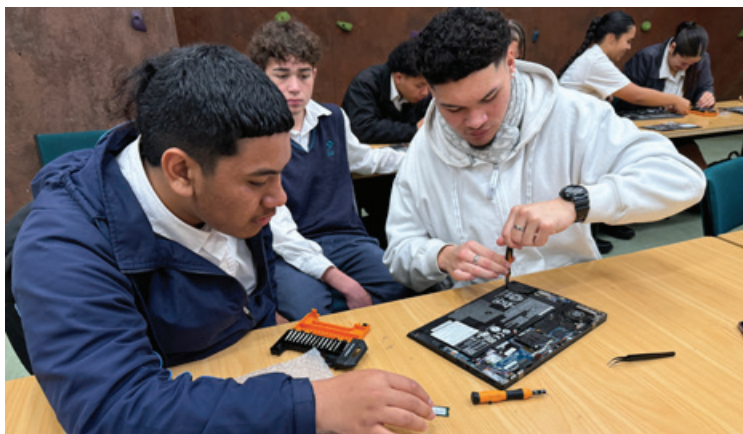
Māngere College students participating in a 'Refurbish a Device' workshop where they made their own laptop device which they then rebooted and fixed themselves.